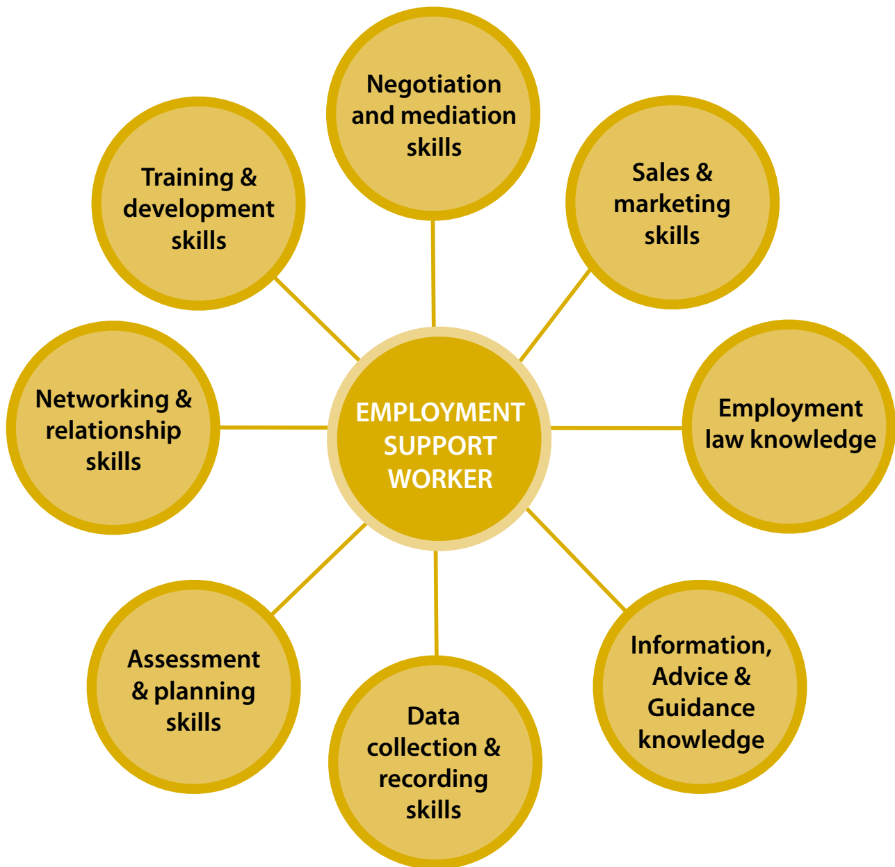
Figure 1: Illustration of the various roles associated with employment support

Staff may enter the profession from a wide range of backgrounds and may or may not have relevant qualifications. Employment Support Workers should be able to gain specialist qualifications according to their national qualification frameworks but a qualification should not necessarily be a pre-requisite to entering the profession. Indeed, having the right attitudes is the most important attribute of Employment Support Workers.